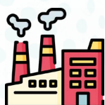
Trades, Investment, and Industrialization