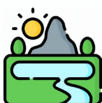
Lands, water, and Natural Resources