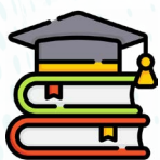
Education & Vocational Training

We the citizens of Nandi have conducted townhall meetings to discuss the priorities within the sectors and came up with our main priorities that should form part of the Nandi County projects in the next five years. The sectors that are presented in this manifesto include.