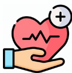
Health & Sanitation