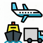
Transport and Infrastructure